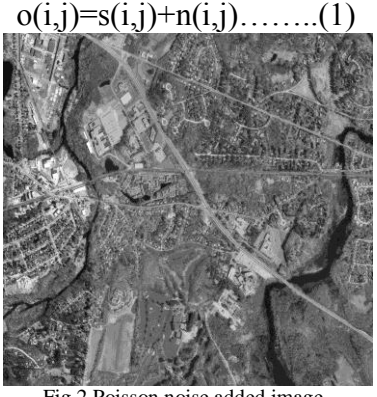
Fig.2.Poisson noise added image.

which adds with original image(s) and affects the acquired image (o) as shown equation (1).