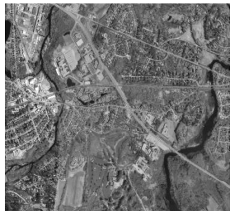
Fig.1.Original image: Concordorthophoto RS Image [20-21]. 2.1 Image Noise

solar radiation is measured images can, in principle, be recorded in the ultraviolet, visible and near-to-middle infrared range of wavelengths. Because of significant atmospheric absorption. ultraviolet measurements are not made. Most common, so-called optical , remote sensing systems record data from the visible through to the near and mid infrared range. The energy emitted by the earth itself (dominant in the so-called thermal infrared wavelength range) can also be resolved into different wavelengths that help us understand the properties of the earth surface region being imaged [3]. So RS Image data or Image taken from Sources is costly due to that we took pan